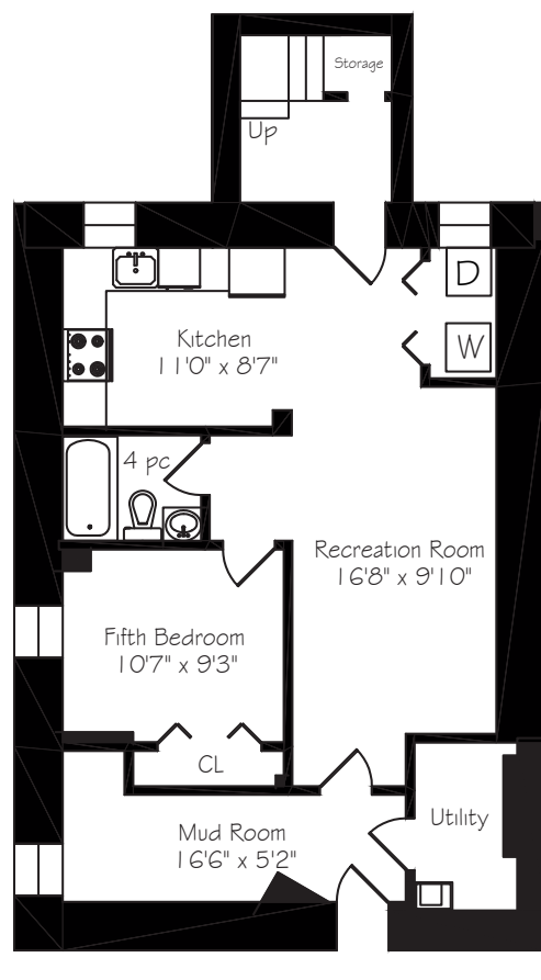
Main Floor 1006 Square Feet