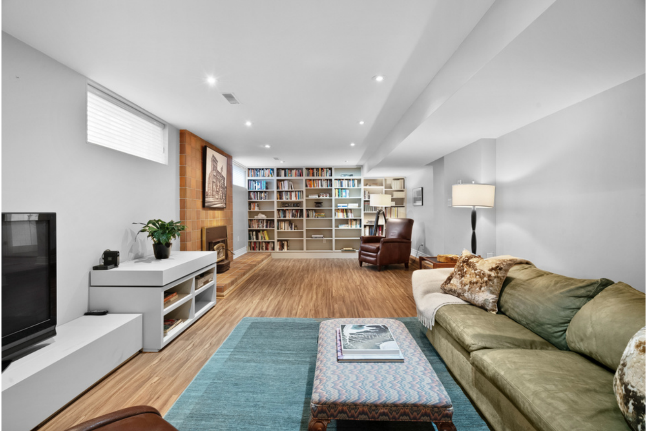
101 LYNDBURST AVENUE