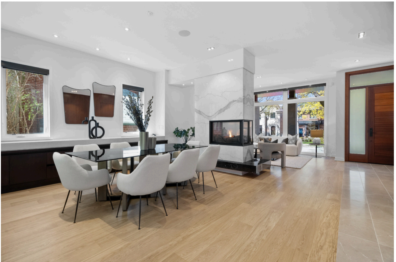
101 RYKERT CRESCENT