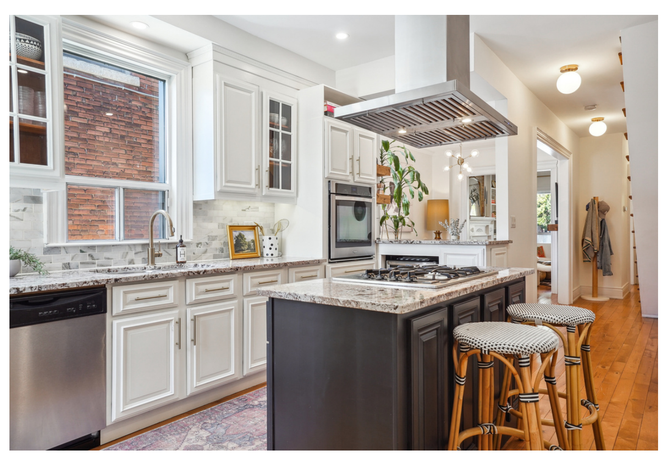
195 WRIGHT AVENUE