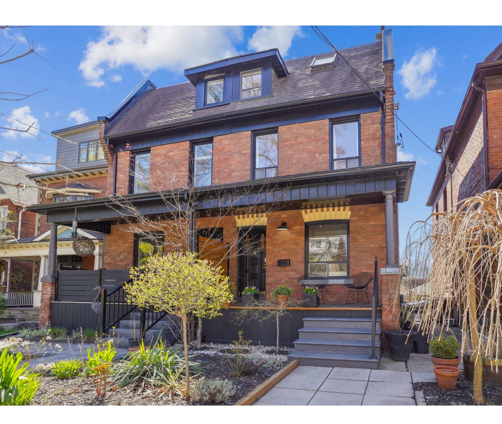
195 Wright Avenue