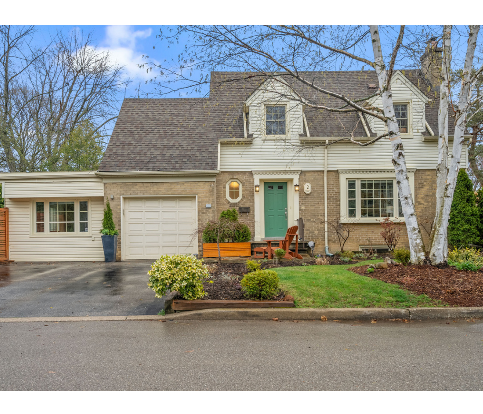
2 Burnham Road