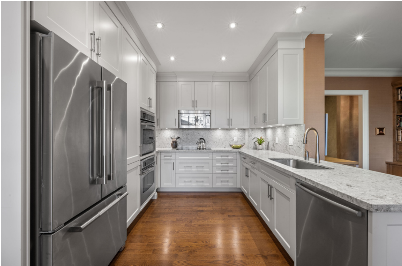
20 BURKEBROOK PLACE, SUITE 117