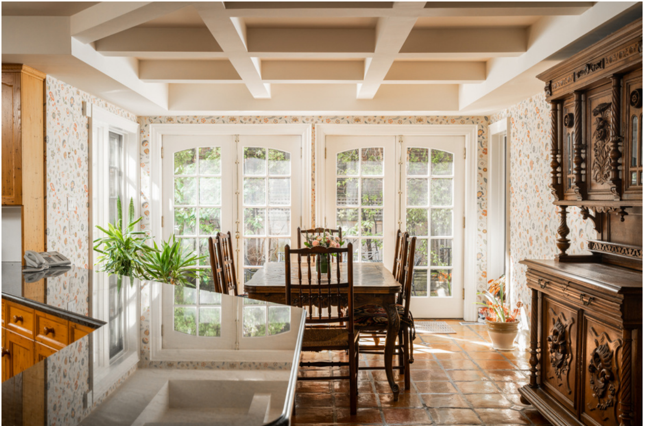
23 DEWBOURNE AVENUE