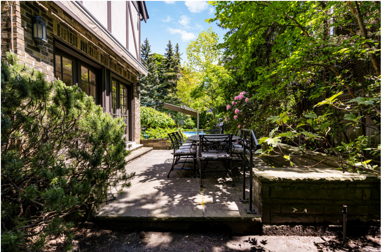
23 DEWBOURNE AVENUE