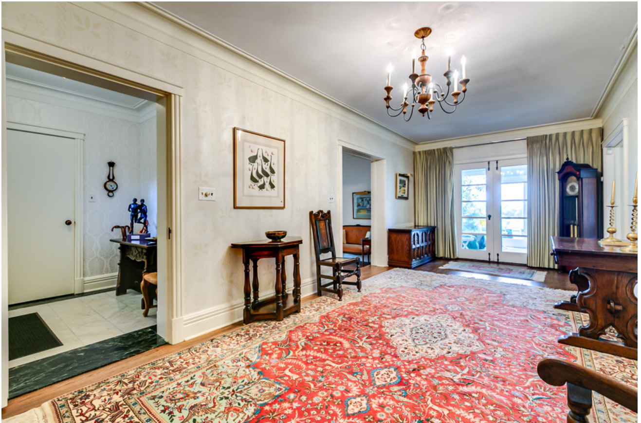
69 BAYVIEW RIDGE