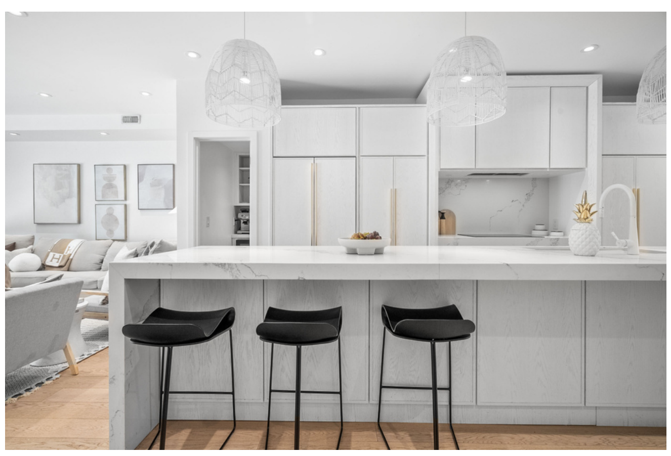
102 HEATH STREET EAST