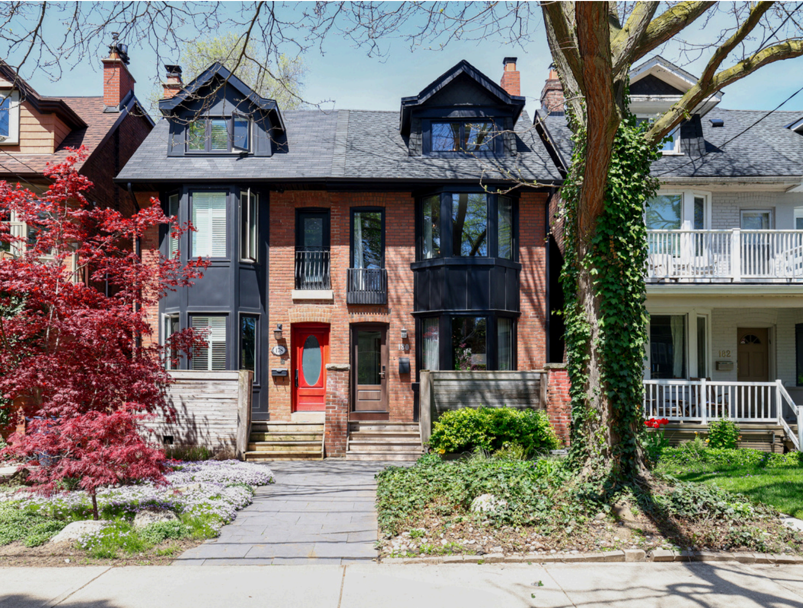
180 Browning Avenue