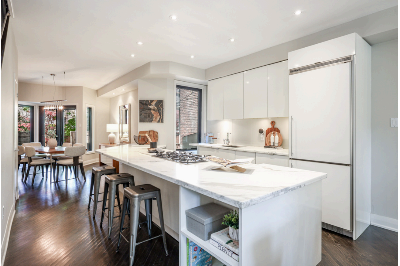
180 BROWNING AVENUE