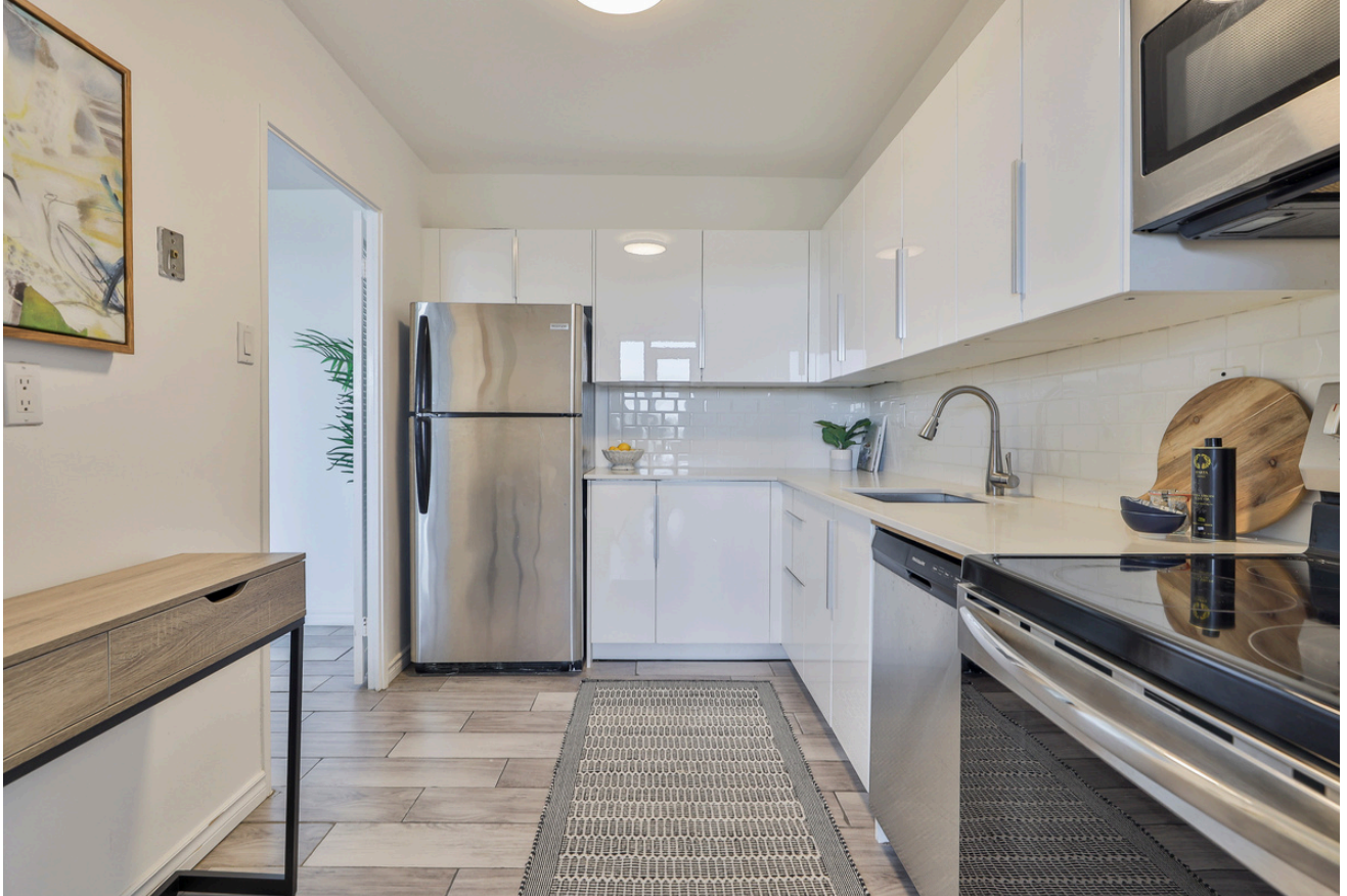
360 RIDELLE AVE UNIT 704